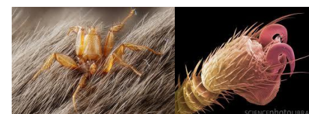
Bat fly attached