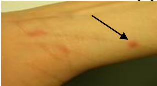
Bartonella CSD "Prodrome" papule

The wife of a veterinarian, who handled many Bartonella -infected cats, was scratched by a client's cat. Although she immediately disinfected the wound, several days later a classic papule developed in one of the scratches (see figure below). The veterinarian was very aware of Bartonella and was testing most cats seen in the practice. Despite reluctance by her physician, he insisted that his wife be treated with azithromycin for 3 weeks. The lesion resolved in several weeks and no lymphadenopathy or severe disease sequelae occurred. The Bartonella antibody titer decreased 8 fold after therapy by our research human titration test. There was no disability and the cost was less than $250 due to the awareness of the human Bartonella symptoms.