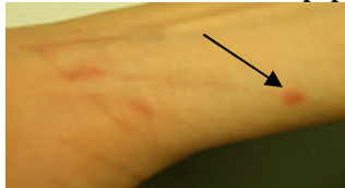
Bartonella CSD "Prodrome" papule

The wife of a veterinarian, who handled many Bartonella -infected cats, was scratched by a client's cat. Although she immediately disinfected the wound, several days later a classic papule developed in one of the scratches (see figure below). The veterinarian was very aware of Bartonella and was testing most cats seen in the practice. Despite reluctance by her physician, he insisted that his wife be treated with azithromycin for 3 weeks. The lesion resolved in several weeks and no lymphadenopathy or severe disease sequelae occurred. The Bartonella antibody titer decreased 8 fold after therapy by our research human titration test. There was no disability and the cost was less than $250 due to the awareness of the human Bartonella symptoms.